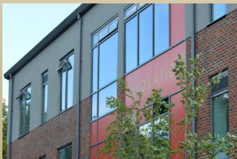
The newly opened Innovation Hub

At Crispin we enjoy offering a wide range of subjects to students in areas you may not always have studied at primary school. In this edition you will hear from some of our students studying subjects like Philosophy, Business Studies and Drama.