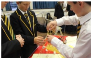
House Leadership Day