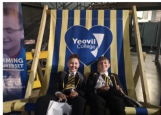
Year 9 Careers Event